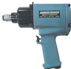
TIW - 27