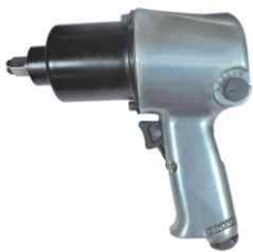
TIW - 16