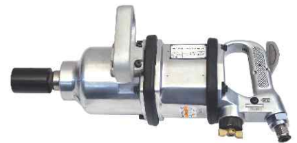
TIW - 76