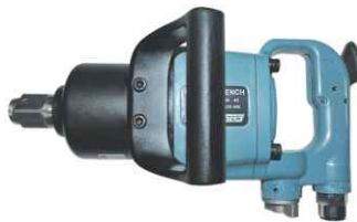
TIW - 48